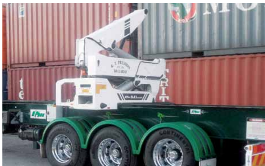
The O'Phee BoXLoader is the result of an international collaboration between O'Phee and French company BXL