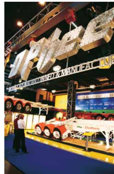
The award winning stand at the 2009 Brisbane Truck Show.