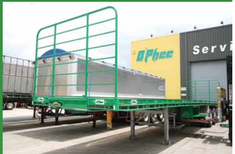
Top: Sharon and Mick O’Phee introduce innovative design with an enviable reputation for quality and durability.