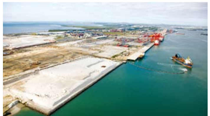
Sand surcharge placement, behind the recently completed Berth 11 rockwall and up to the Terminal 11 trial area, is almost complete.

Construction of the Port of Brisbane Corporation's seventh dedicated container berth, Berth 10, is now complete. The wharf was constructed by Albem and finished ahead of schedule in February 2008. The berth is to form part of Patrick's Terminal operations when Patrick completes construction of their Terminal 10 facility at the end of 2008.