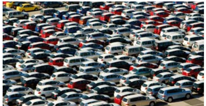
A minimum Green Vehicle Guide rating of 10.5 out of 20 must be achieved, and the greenhouse emissions rating must reach at least 5 out of 10.

the emissions offset through this programme were equivalent to removing over 130 cars from the road for a year.