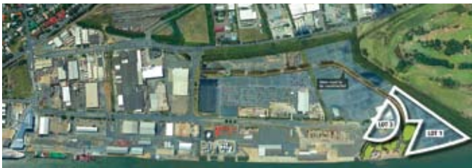
Northshore Hamilton will revitalise 80 hectares of former port land.

For more information please visit www.northshorehamilton.com.au .